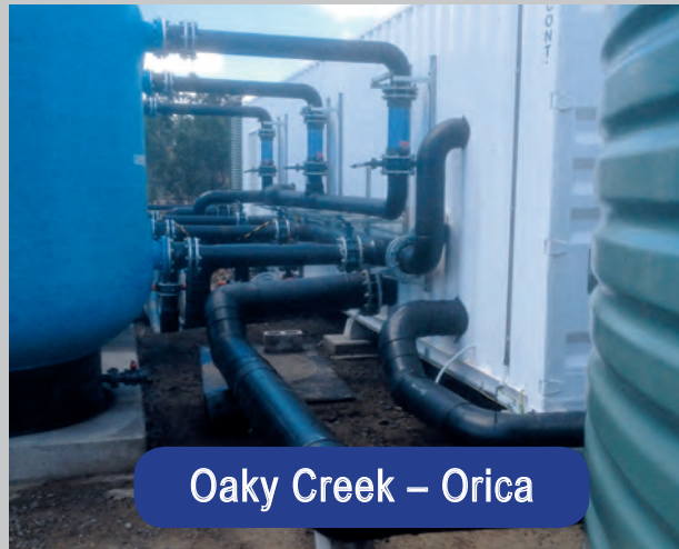
Oaky Creek – Orica